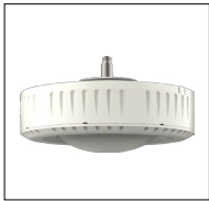
PIR Sensor Model No. MBL-CL-PIR