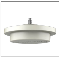
Microwave Motion Sensor. Model No. MBL-CL-MS