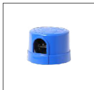
Photocell Control ON/OFF automatically according to day light. Model No. MBL-TCL-SEN