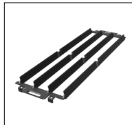
House-side Shield. PC Material for back light control Model No. MBL-TCL-SHIELD