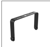
U Bracket Wall mounting or pole top mount. Model No. MBL-TCL-U