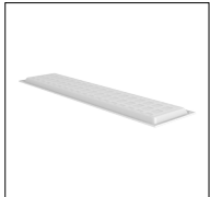
Backlit LED's 100% Directional light to maximise the brightness and efficiency