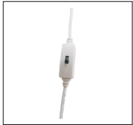
Colour changing switch to allow the flexibility of keeping the consistent fitting throughout with multiple colour options if you wish to change in time.