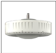
Motion Sensor Model No. MBL-HBPA-SENSOR