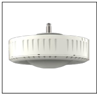
Motion Sensor Model No. MBL-HBPA-SENSOR