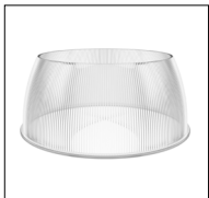
PC Reflector Model No. MBL-HBPA90-150-REF