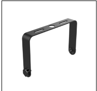
U Bracket Wall mounting or pole top mount. Model No. MBL-HBPA-U